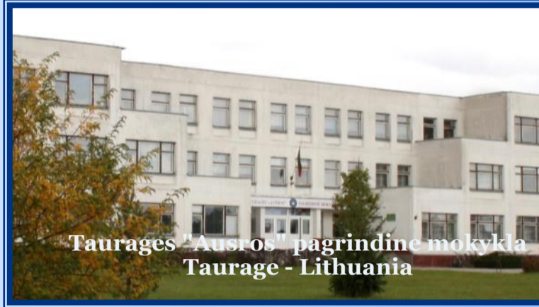
Tauragės „Aušros“ pagrindinė mokykla Taurage - Lithuania